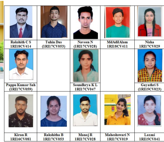
8th sem students who got Placed in 2021