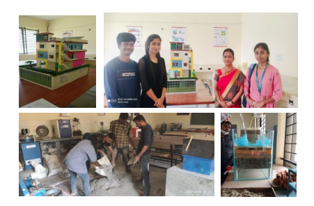
8th sem students during their Project work MERAKI Project Exhibition 2021