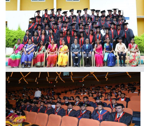
Graduation Day 2021